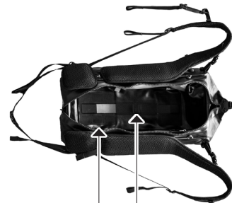
Waterproof hydration tube port (tube not included)