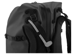
Attachment for hydration system (optional accessory)