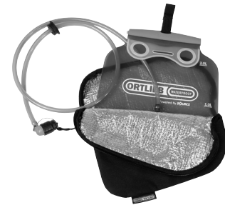
Hydration system in insulation pocket