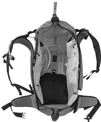
Hydration system inside Atrack