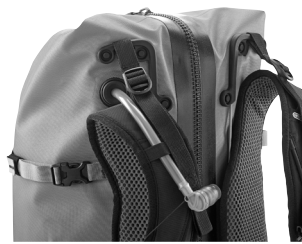
Waterproof drink tube port