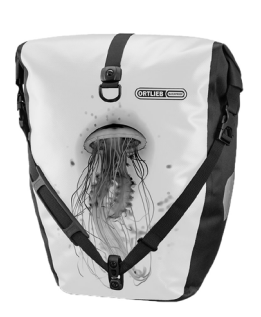
Design 2: Jellyfish