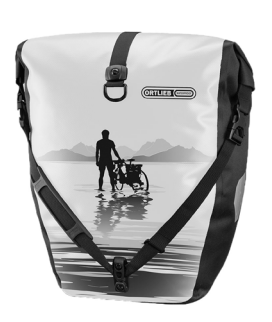
Design 1: Lake