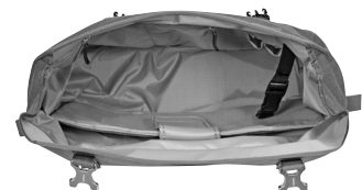
Inside: padded laptop sleeve