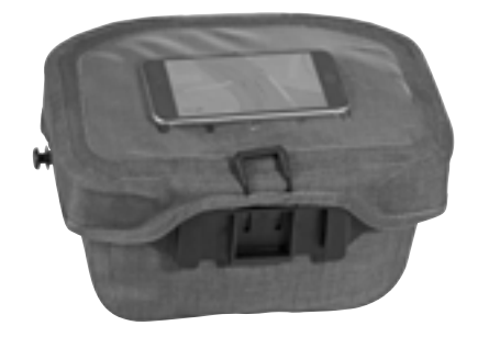
Smartphone in transparent lid compartment (not included)