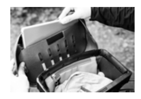
Opening lid compartment: 20,5cm / 8.1in.