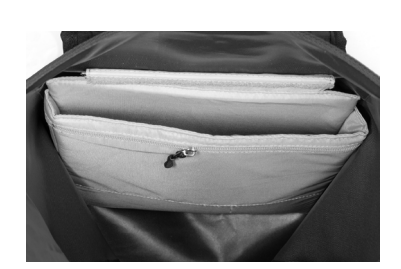
Inner pocket for laptops